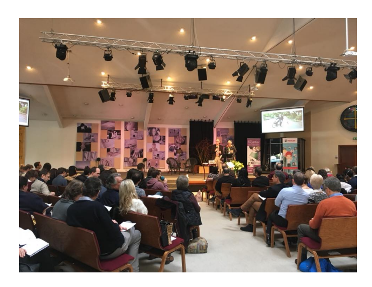
A Day Together events have also been hosted recently in Cambridge and Newcastle.

event was led in English with simultaneous French translation, something that the team had not attempted before. One of the translators mentioned she'd learned much from the day too.